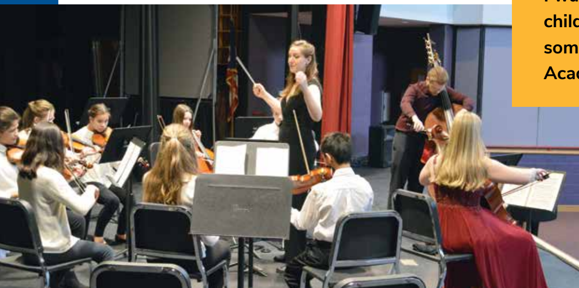
The Middle School Chamber Orchestra performs with Cleveland Orchestra bassist and Cleveland State University faculty member cellist.

"I want to change a child's life by giving someone a Lake Ridge Academy experience."