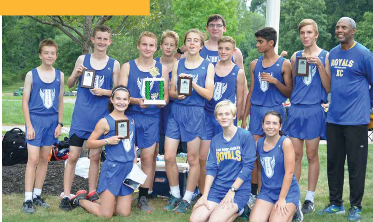
Enrollment growth helps build extracurricular and athletic programs.

As enrollment has grown because of scholarships, student life has changed in a positive way too. Extracurricular activities have increased and become more robust as more and more students participate.