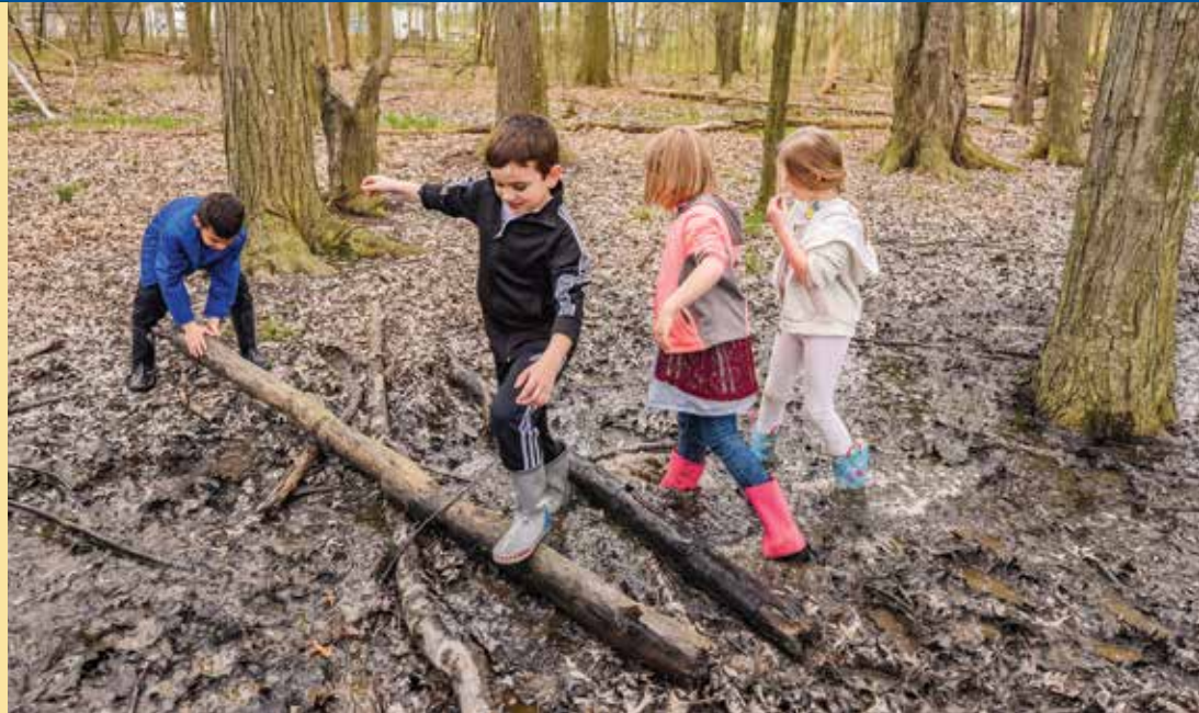
First graders explored the west woods on an early spring day.